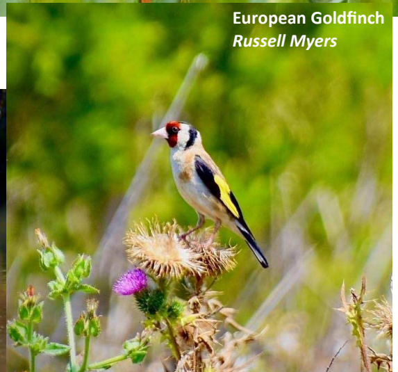
European Goldfinch Russell Myers