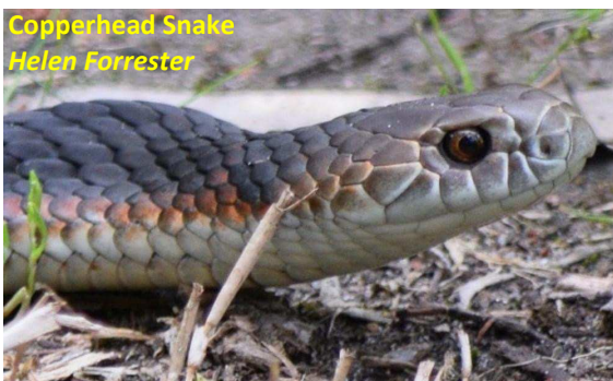
Copperhead Snake Helen Forrester