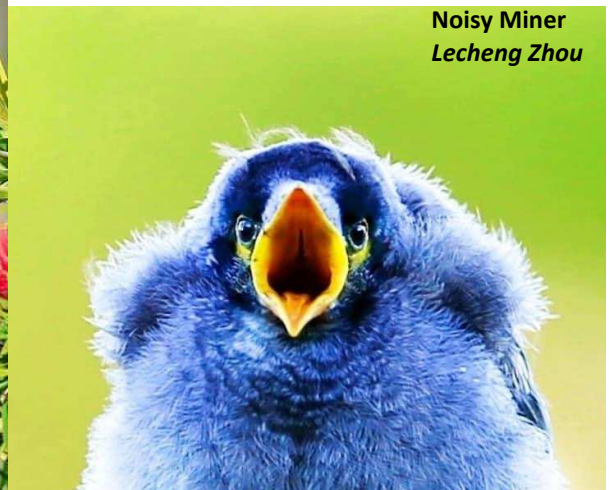
Noisy Miner