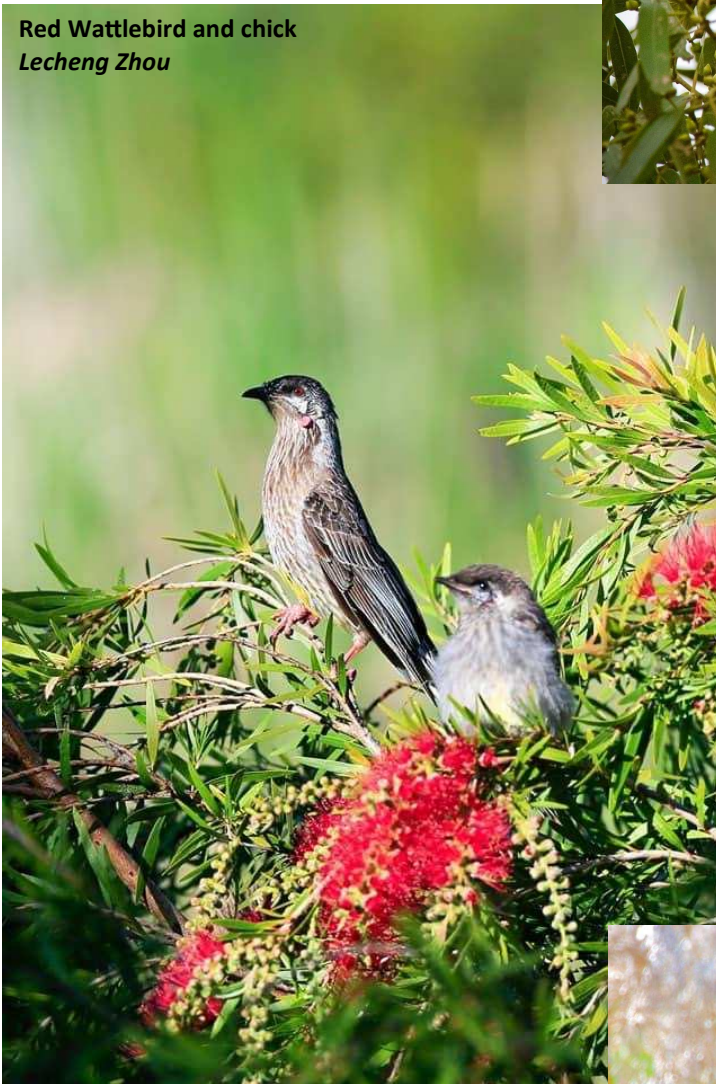
Red Wattlebird and chick Lecheng Zhou