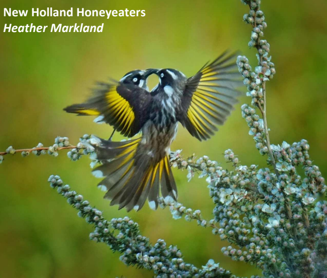
New Holland Honeyeaters