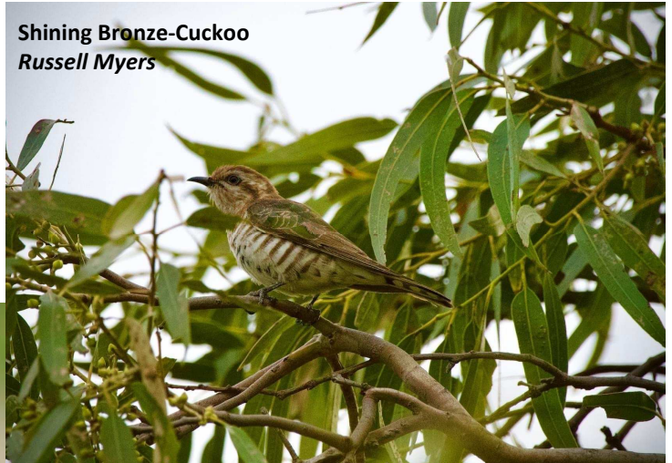
Shining Bronze-Cuckoo Russell Myers