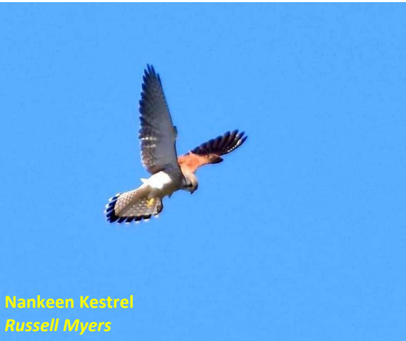
Nankeen Kestrel