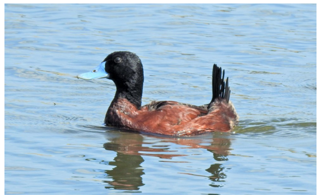
Blue billed Duck Ain't I pretty?