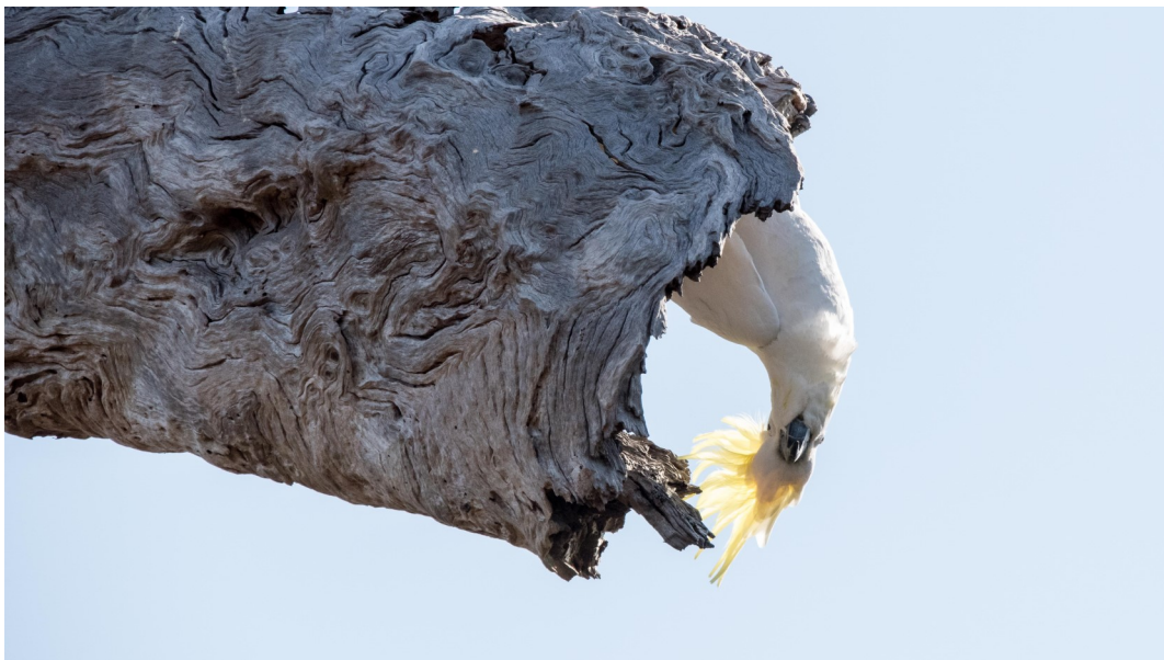
Sulphur Crested Cockatoo Who's There?