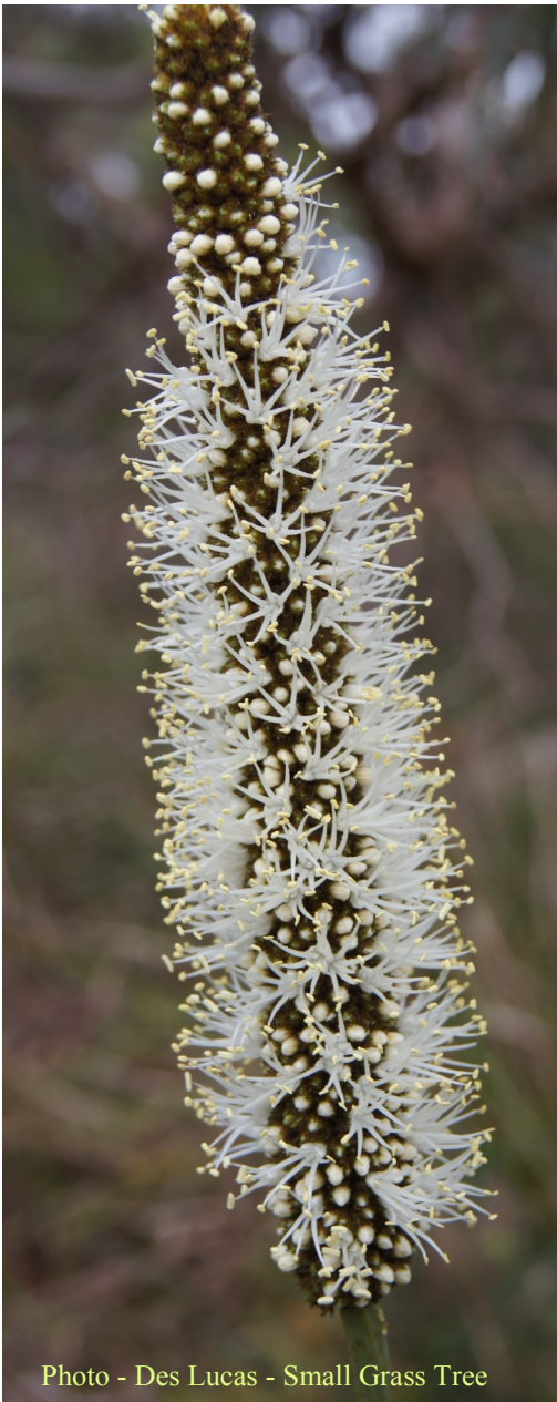
Small Grass Tree