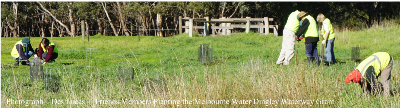
Friends Members Planting the Melbourne Water Dingley Waterway Grant

Parks Victoria are the first to praise the volunteers who work, and I mean work, in the parks but they are now relying on the volunteers to pick up the extra activities that comes with reducing the number of rangers servicing the parks. At Braeside Park, each Wednesday 10-12 volunteers carry out a variety of jobs for three hours such as spreading mulch, mowing, weeding, planting, removing introduced trees etc. and now the volunteers have volunteered to open the Visitors’ Centre because the rangers have to patrol extra parks as well as Braeside Park. Many volunteers are working full