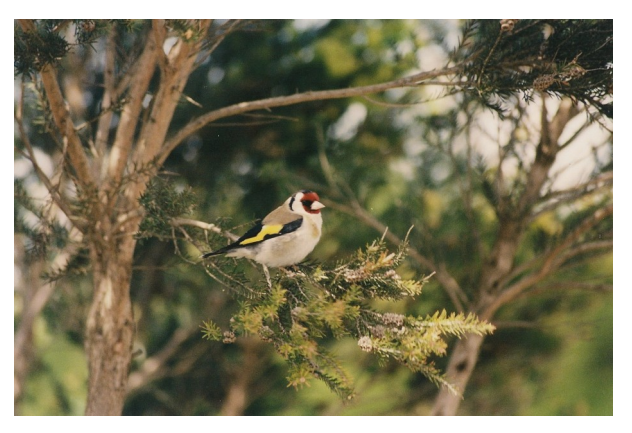
European Gold Finch

The past few months have seen some very welcome rain and not so welcome cold weather. They have also produced some fantastic bird sightings around the park including Wedge-tailed Eagle (x2), Mistletoe Bird, Flame Robin, Red-kneed Dotterel, White-bellied Sea-Eagle, Little Eagle, Australasian Bittern and Eastern Spinebill. If you're an old hand or new to bird watching be sure to joint the monthly bird monitoring group (pssst you even get to go to some of the off-limits areas of the park away from the main trails!)