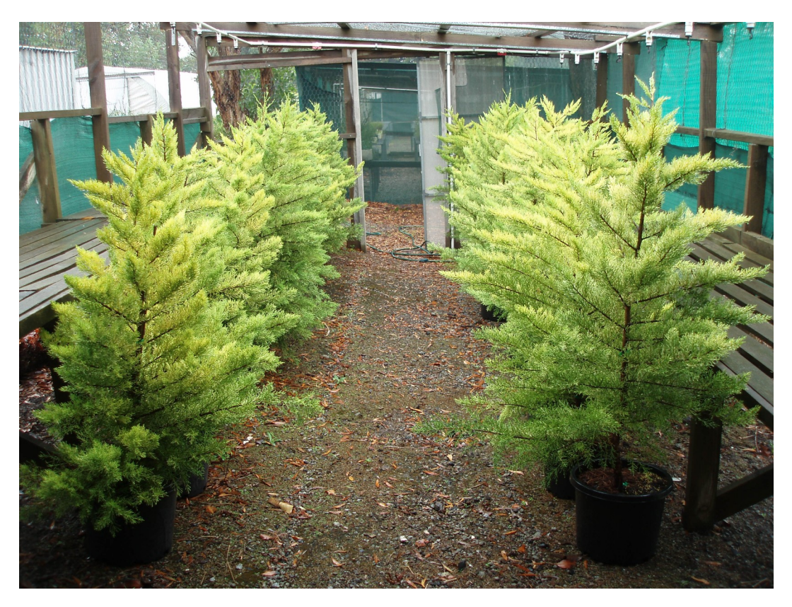
Cupressus macrocarpa var. aurea awaiting planting.

As part of the Cypress Drive tree replacement program, 14 Cupressus macrocarpa var. aurea have been purchased and will be planted by the Wednesday project group during May.