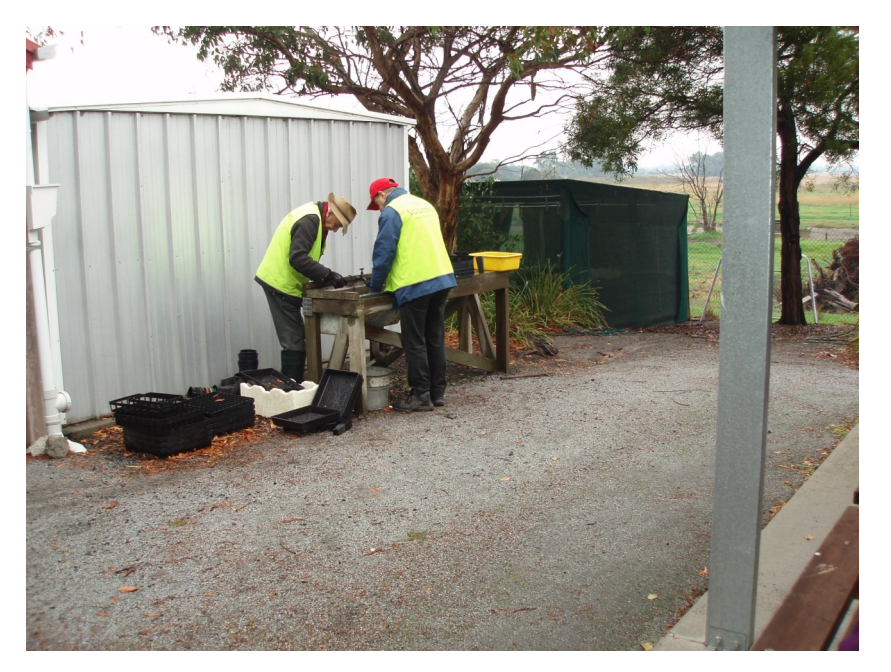
Volunteers busy cleaning tubes ready for potting up.

OH JOY our favourite - one morning spent moving & raking mulch in the picnic area close to car park 8.