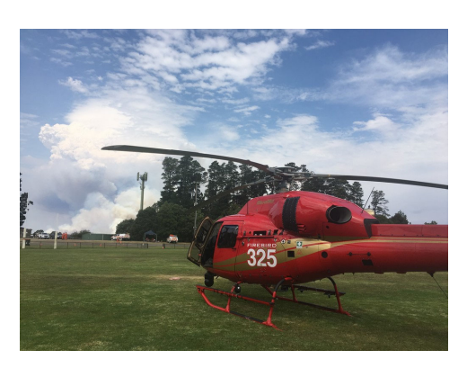
By Des Lucas

effective and cohesive manner. Finally other staff from the Park provided fire front ground support efforts for the fire suppression campaign.