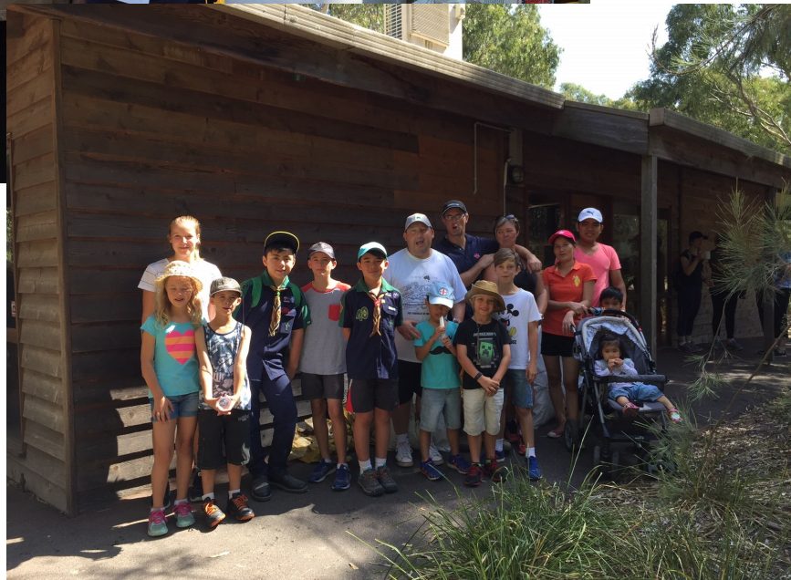
Kingswood Primary School