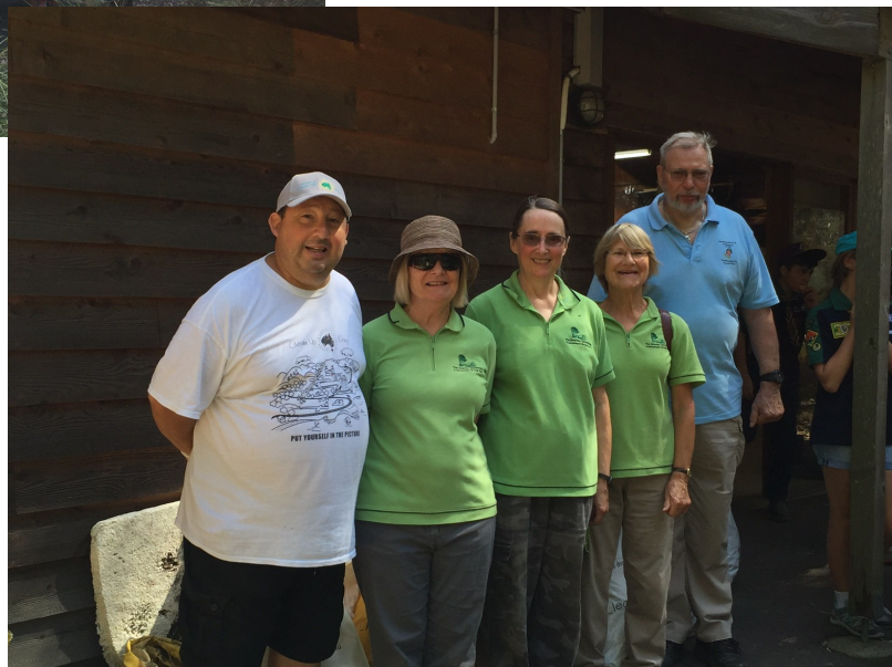
Friends of Greater Dandenong & Braeside Park