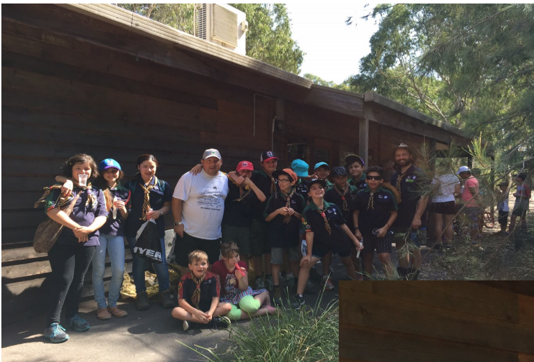
Dingley Village Scouts

There were some members of the local community but members of a variety of community groups turned up also on the day:-