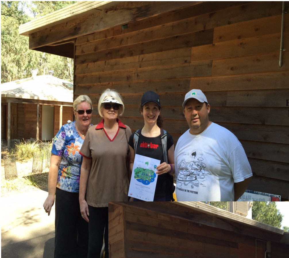
Bendigo Bank, Mentone East