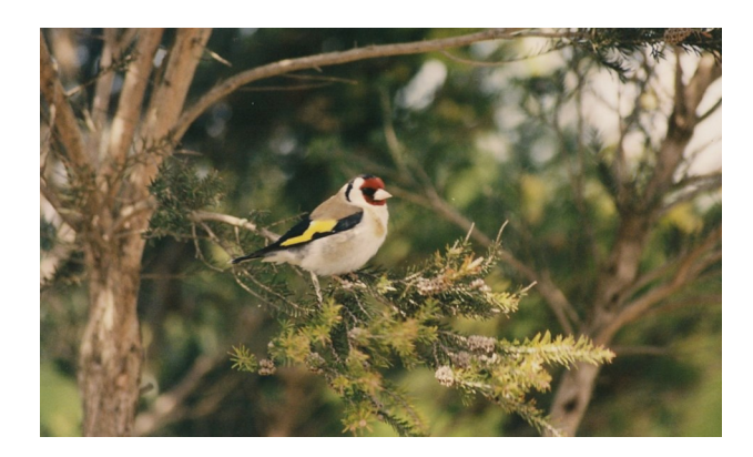
European Goldfinch.

The weather has remained relatively cool throughout January and February and the main wetlands have thus been able to retain some water over the summer period. Small numbers of Pink-eared and Blue-billed Ducks have remained on the wetlands over summer. Of particular note over the past couple of months have been reports of a Wedge-tailed Eagle, Nankeen Night Heron and Sharp -tailed Sandpiper. Perhaps the most exciting report is that of a Peregrine Falcon that was spotted flying very high over Braeside Park.