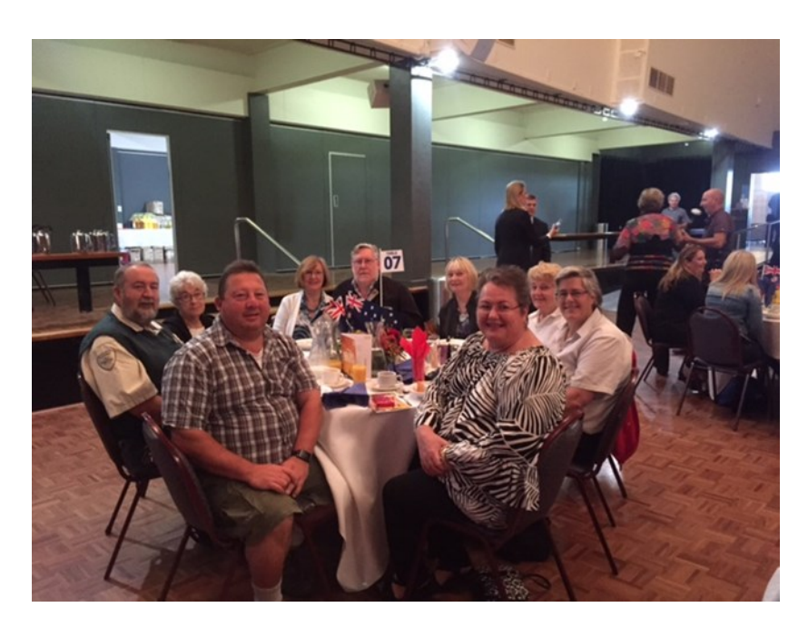
Friends members at the award ceremony enjoying breakfast.