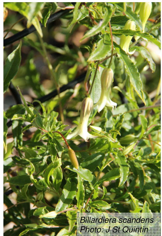
Billardiera scandens