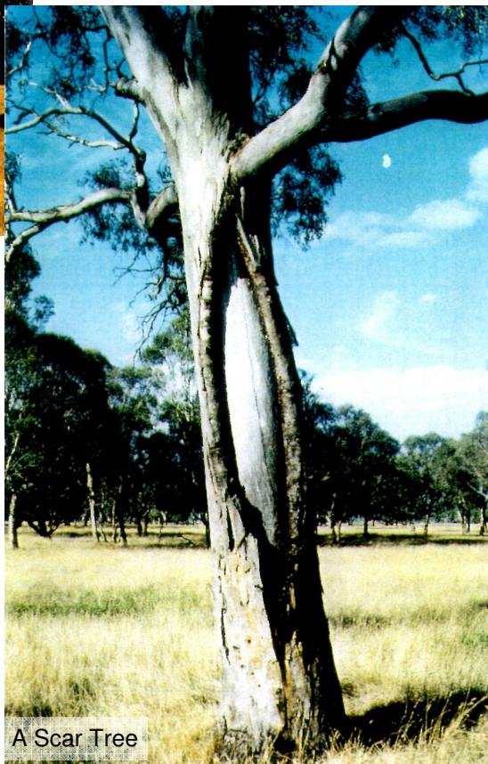
A Scar Tree

The Park still has two fine very old gums along the Dingley waterway which are regularly visited by groups touring the conservation bush area of the Park.