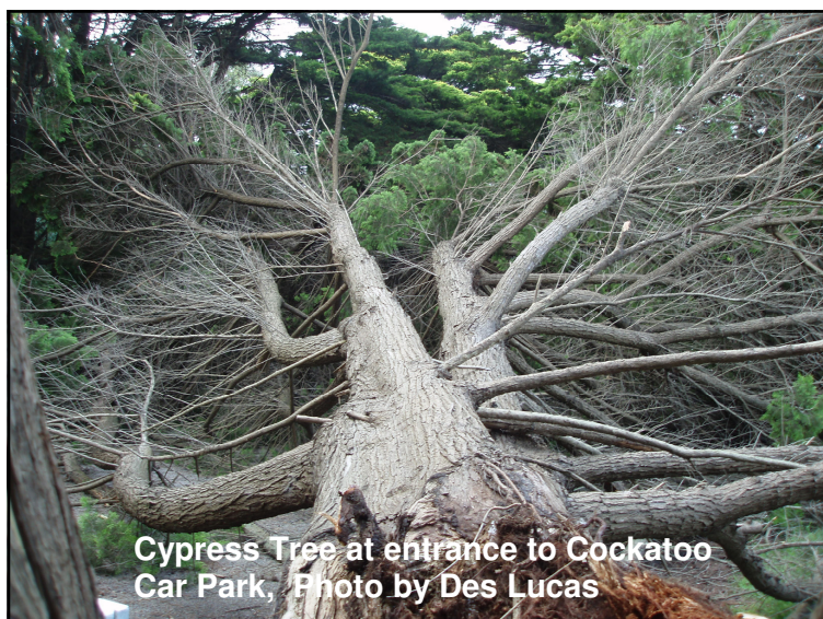
Cypress Tree at entrance to Cockatoo Car Park, Photo by Des Lucas

The Cypress Trees were planted in 1939 to form an avenue to the pump house for the Braeside Sewage Plant which operated on the site from 1940 to 1978.