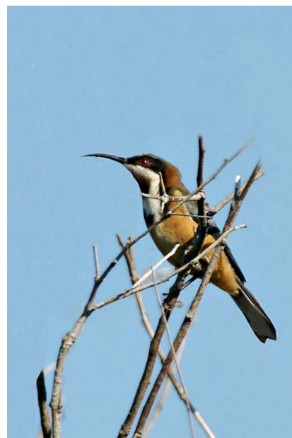
Eastern Spinebill in Braeside Park.

The next mist netting session will be on Saturday the 14th of August. In the mean time have a good winter.