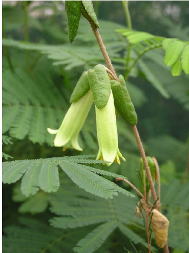
Correa in flower in the nursery.

We are mostly collecting cutting material at present. There is seed available for Eucalyptus prioriana but not a lot else. On a walk through the Heathland, Greenhood Orchid leaves can now be seen, and the Correas are in full flower. Throughout the Park, the rust coloured male flowers of Black She-oak ( Allocasuarina littoralis ) add colour to the carparks and heathland. In the damper spots, moss and Crassula hug the ground.