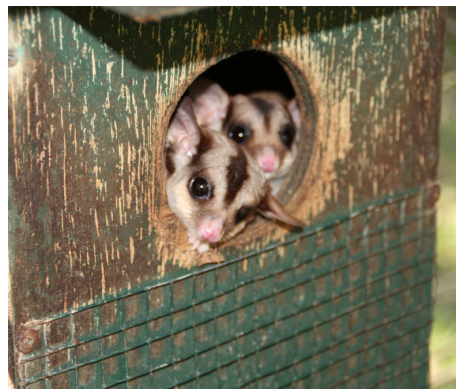
Sugar Gliders, taken at Moonlit Sanctuary.