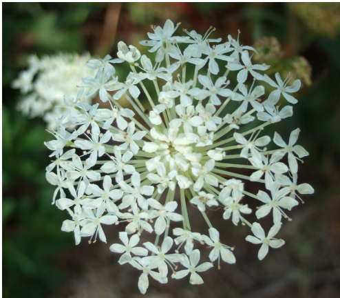
Trachymene composita flower. The Heathland was full of these flowers through late spring/early summer with most of the flower stems over 1.5mtrs tall—a stunning sight.

Dianella , Austrostipa and Trachymene composita (wild parsnip) have made particularly good shows in the heathland this year, and Tiger orchids ( Diuris sulphurea ) popped up in many places at the end of spring. The wedding bush ( Ricinocarpos pinifolius ) hung on for quite a long time and had a resurgence after earlier good rains. It's fascinating to see how well the plants respond to the extra moisture.