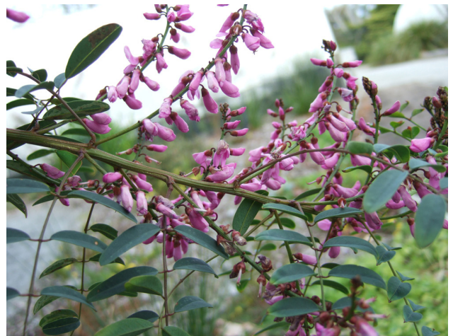
Indigofera australis flowering at the community garden near the nursery.

Around the Nursery: the school gardens and the community gardens have come on wonderfully, and there are still areas to be planted. The Goodenias are thriving and will be useful for many cuttings – their bright green colouring is a change from many of the duller colours of much of our foliage. Indigofera australis flowered well this year and have given us plenty of seed. The pond has grown with the extra rains and the occasional frog can be heard. There are some good reflections possible for the photographers among us.