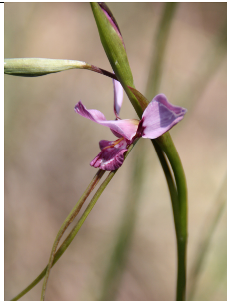
A Purple Diuris (One of Ernie's babies!)

Extra help is always needed for a variety of jobs: meet at the Park Office, Wednesdays 9 am - 10.30 am morning tea (3 "C"s - Cuppa, Cake & Chat)