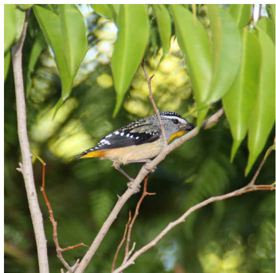
Pardalote on his way to feed the babies.

If you are unsure where to start why not come down to the nursery and help out on a propagation morning (see the activities calendar on page 3 for dates) and whilst spending a pleasurable couple of hours helping out with pricking out or pot washing you can pick the brains of the other people there. Or go for a walk in the park and be inspired by the community garden areas and don't forget the nursery is open for plant sales on the 3rd Sunday of each month from 10am to 12 noon. In no time at all you too can be having babies in your back garden!!