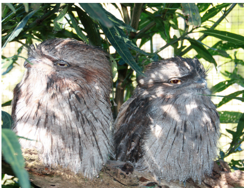
Pair of Tawny Frogmouths, taken at Moonlit Sanctuary.

Conservation Volunteers Australia (CVA) held a night walk in the Park recently. Highlights of the walk were seeing two sugar gliders, ring tail and brush tail possums and lots of birds including a Tawny Frogmouth.