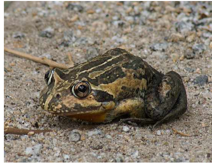
A Striped Marsh Frog

And on that completely trivial note we end.