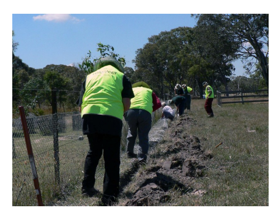
Wednesday Project Group fencing the Grasslands, December 2007.