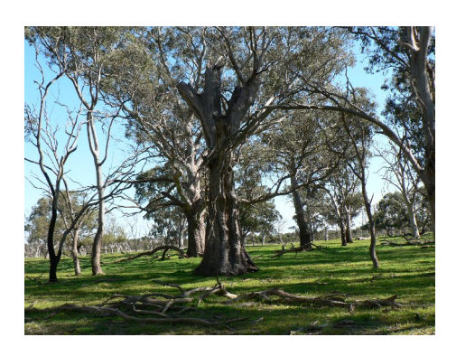
River Red Gums, living and dead, in the Park's south.

An even more labour-intensive solution would be to graft our River Red Gums onto Tasmanian Blue Gum stock. The Blue Gums have deep tap roots that are more salt tolerant. Again, we are not yet considering this option.