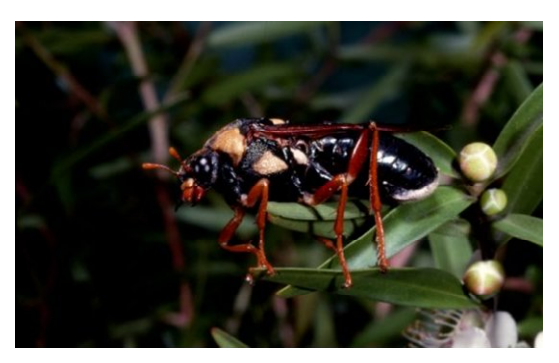
A Steel Blue Sawfly.

Their common name of "Spitfires" comes from a defensive habit that these larvae have of exuding a nasty brown fluid. They don't actually spit but rather dribble the unpalatable fluid. The term "sawfly" refers to the ovipositor of the female wasp. This saw-like instrument is used to lay her eggs. The larvae pupate in leaf litter and the pupal duration can be up to two years